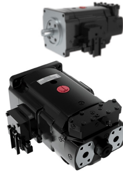
Parker HPS' Gold Cup Series Hydrostatic Pumps and Motors

Gold Cup successfully met the fracturing truck's operating requirements, including reliable and durable performance, while ensuring continuous and stable operation of the equipment. Finally, Parker was able to deliver prompt delivery and technical service to ensure the company's success with Gold Cup.